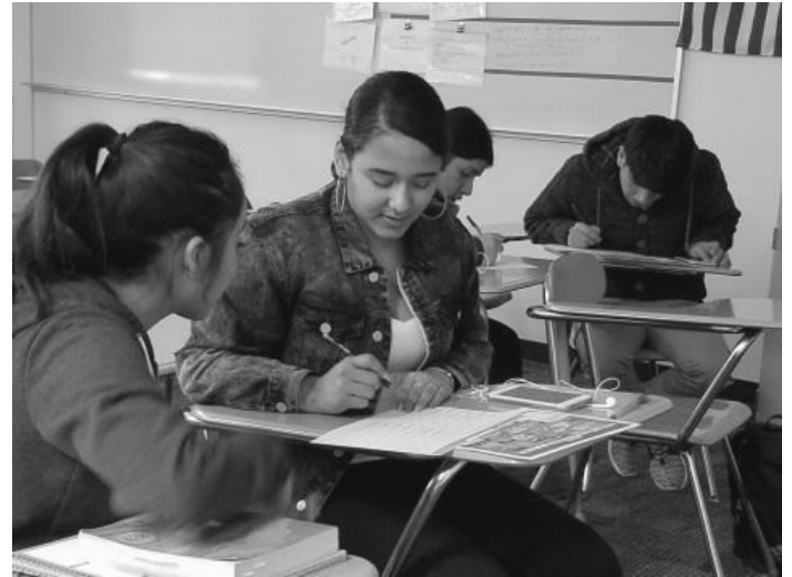
Lee High School students learn about making smart money choices and personal finance with UCOM and Junior Achievement